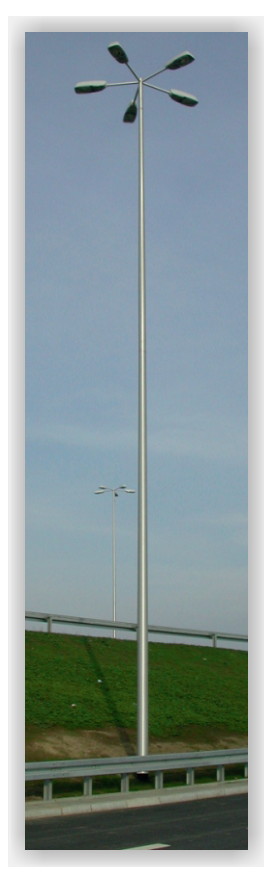
Note: The number of diameter reductions depends on the post type.